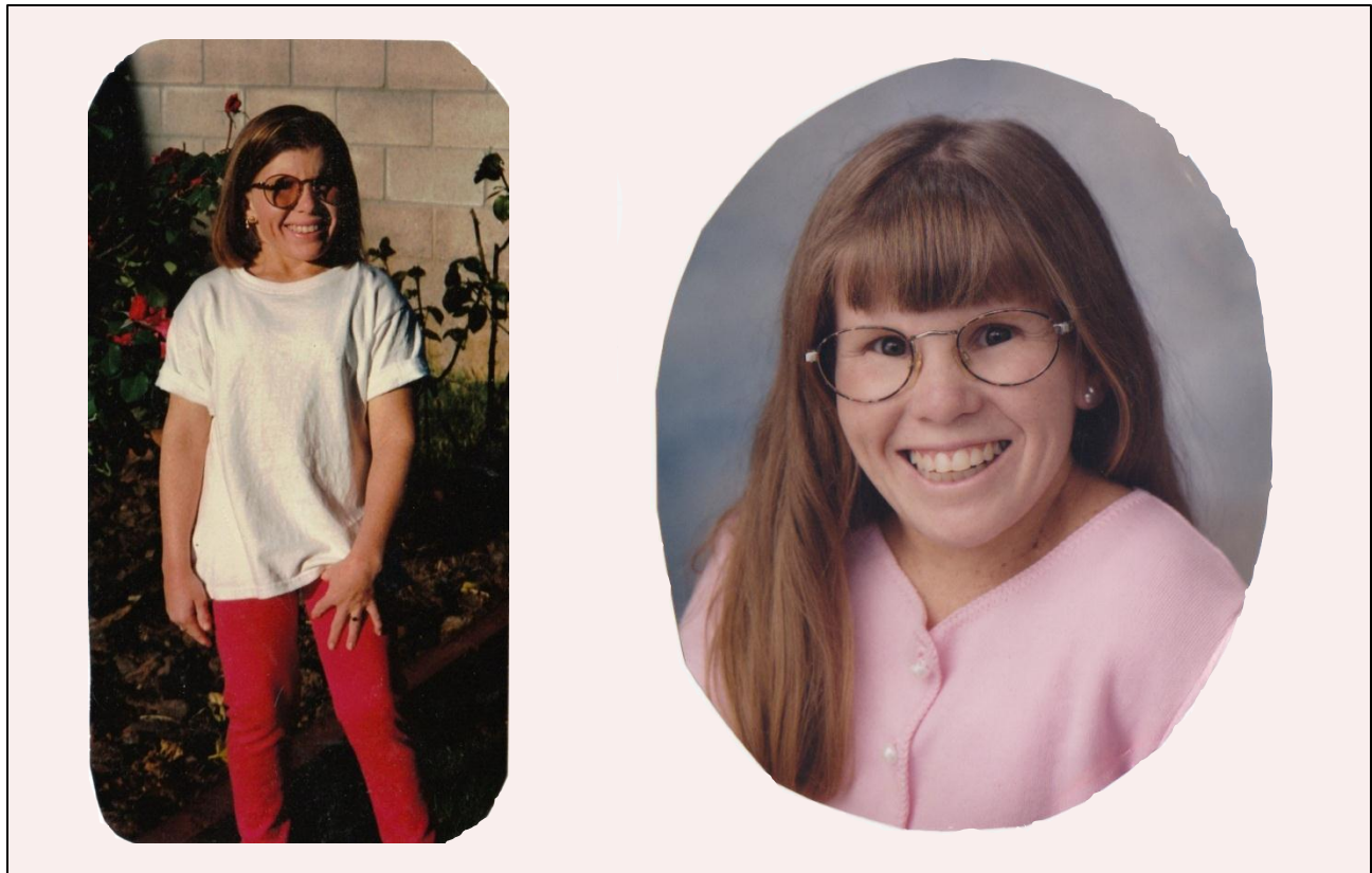
Figure 2. Patient 2, very mild. Left: 18 years. Right: 21 years. This individual was never cachectic and inadequate food intake was never a problem for her. Tooth extraction and braces reduced malocclusion. “She loved to swim, ride bikes, take walks, and shop. She would tell everyone, ‘I was born to shop.’”

MILD CS. Children and adults with mild CS share many traits with other CS patients, including very short stature, developmental disabilities, hearing loss, vision problems, and sun sensitivity (Figure 2). However, the skills attained and average age at death (30.6 years) in mild CS are significantly increased over other groups. As a result, many in this group are not suspected of having CS until adulthood and/or after they have visited many physician specialists — if they are diagnosed at all. 19, 79 The literature describes mild CS/CS in adults as atypical or rare, 1, 14, 18, 19, 37 yet the even distribution of severity group membership among survey subjects here (Table 1) implies that mild CS may be under-diagnosed.