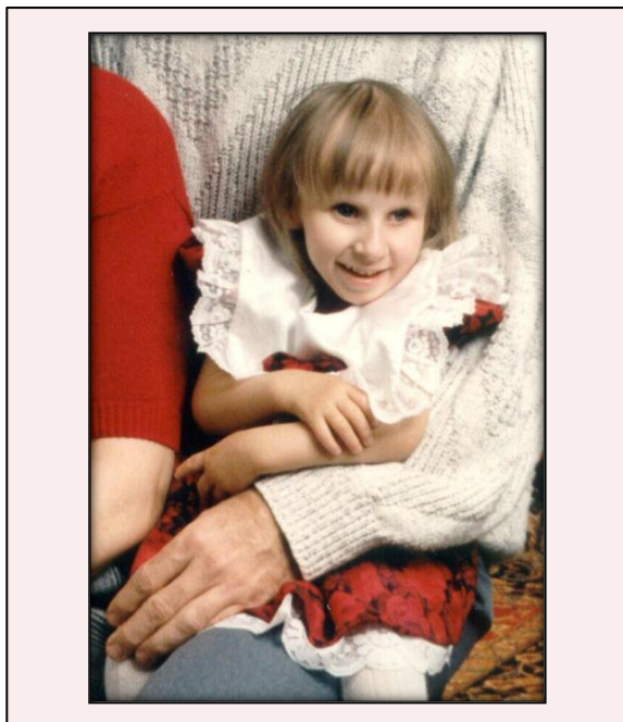
Figure 1. Patient 1 (here, 5 years, 11 months), severe/borderline moderate. “She was a living example of unconditional love who touched everyone she met.”

SEVERE CS. Children in this group have the shortest life expectancy (5.0 years) and are the smallest of all people with CS. The most severely affected survey subjects were the size of a six-month-old infant at age 3 years or older, could not sit up, and could not speak. The less severely affected members of this group were larger (up to the size of an average 18 month–2 year old child at age ~6–7 years) and were more communicative in that could sign or say a few words. Many in this latter subgroup could cruise on furniture or use a reverse walker. All children in this group were described by parents/doctors or observed by the author as happy and outgoing (Figure 1).